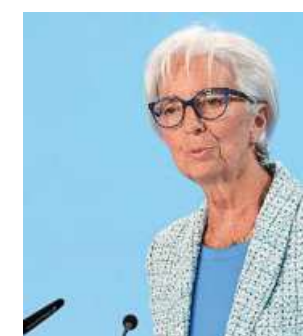
Christine Lagarde, President of the European Central Bank

While ECB policymakers signalled their confidence that inflation was gradually being tamed, there was also