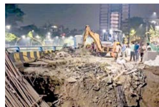
Debris being cleared from the site after a steel structure of metro pillar collapsed near Chinchwad railway station, in Pune