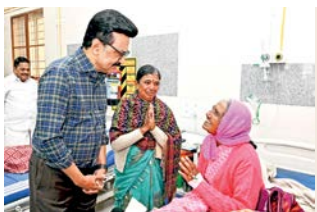
Tamil Nadu Chief Minister MK Stalin interacts with patients during a visit to the Government Medical College Hospital in Nilgiris