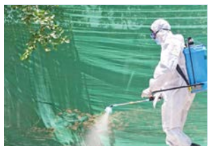
A worker sprays medicine at Kanpur zoo premises amid apprehensions of possible spread of bird flu, H5N1 virus in Gorakhpur