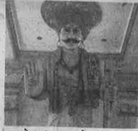
कुळणेश्वर ब्राम्हण देव

डिचोली, ता. १२ (प्रतिनिधी) : औद्योगिक वसाहत, डिचोली येथील श्री कुळणेश्वर ब्राम्हण देवस्थानच्या प्रतिष्ठापनेचा सहावा वर्धापनदिन मंगळवार २० फेब्रुवारी रोजी साजरा करण्यात येणार आहे. यानिमित्त चार दिवस विविध धार्मिक आणि सांस्कृतिक कार्यक्रमांचे आयोजन करण्यात आले आहे.