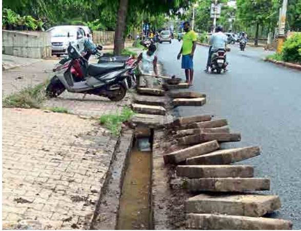
वास्को : स्वतंत्रपथ मार्गावरील गटरातील माती काढताना मुर्गाव नगरपालिकेचे कामगार.

भरती लवकर करावी अशी मागणी नवनिर्वाचित नगरसेवकाकडून होत आहे. सध्या मुर्गाव पालिकेतर्फे वारको शहरी भागातील पावसाळ्या पूर्वीची कामे हातात घेतली आहे. तीन ते चार कामगार मिळून स्वतंत्रपथ मार्गावरील गटरातील गाळ उपसण्यात सुरुवात केली आहे. पुढील आठवड्यात सर्व प्रभागातील पावसाळ्यापूर्वीची कामे हातात घेऊन पूर्ण करण्यासाठी पालिका प्रयत्न करणार असल्याची माहिती पालिका अधिकाऱ्यांमार्फत देण्यात येत आहे.