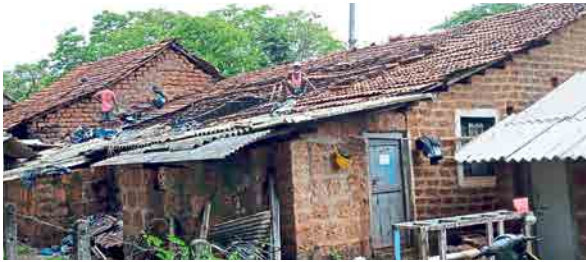
साकोड्यांत : घराची दुरुस्ती करताना कामगार.

कामे खोळंबली होती. काही लोकांच्या घरांची दुरुस्ती करणे आवश्यक असल्याने ती कोणत्याही परिस्थितीत उरकून घेणे अत्यावश्यक होते. ते काम जलदगतीने पूर्ण करण्यासाठी कामगारांची शोधाशोध करत होते. बोळकणें साकोड्या येथील एका घराचे दुरुस्ती करण्याचे कामास सकाळपासून सुरुवात केली होती. अभूतमधून पाऊस पडत असल्याने घराच्या दुरुस्तीच्या कामात व्यत्यय येत होता व काम वेळेवर पूर्ण करता येत नव्हते. पावसात भिजत घराचे काम पूर्ण करण्यासाठी कामगारांनी कंवर कसली होती.